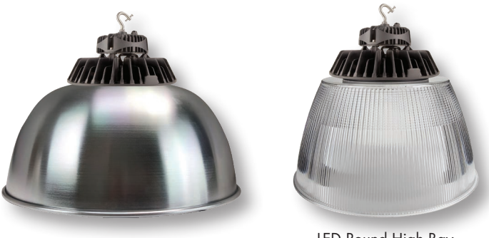
LED Round High Bay with aluminum reflector