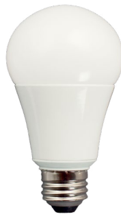
L16A19N10 L16A19N15 L15A19D25