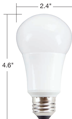
Wet Location A19 A-Lamp