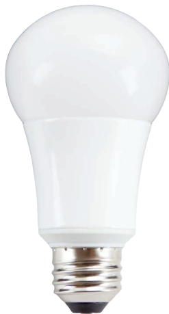
Wet Location Omni-Directional A-Lamp