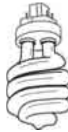
2 Piece SpringLamp